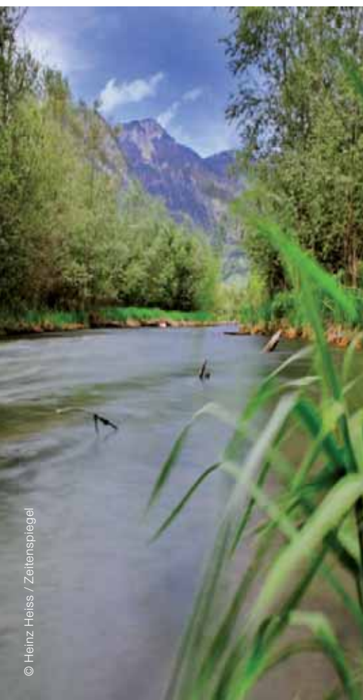
Picture 3: Only scarcely ten percent of the length of the most important Alpine rivers is in natural or near-natural state.

The constraints imposed on all water uses are significant: many will need to be limited and numerous other pressures, such as pesticide pollution, should decrease or disappear. Significant flows will be returned to rivers and many artificial management schemes will require dismantling or adaptation. Effort will be directed at restoring natural habitats and ecological functions, accompanied by a boost in demand for ecosystem services, perhaps introducing fundamental changes in land use patterns. The requirement for full cost recovery – including environmental externalities and resource scarcity – is likely to have significant impacts. Demand is not to be considered simply as a need to be satisfied regardless of cost. Potential value is to be weighed up against full cost and, as far as possible, this cost passed on to the user.